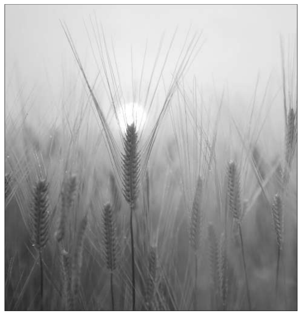
Abbots Morton, Rous Lench, Church Lench & Harvington www.archbenefice.org.uk