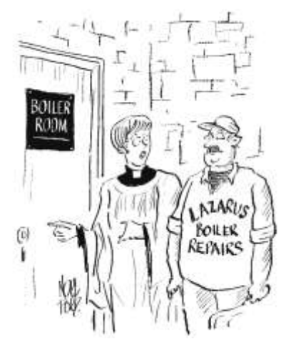
Given the state of our heating system, your name seemed rather appropriate