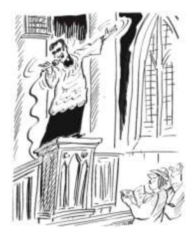
The vicar got a little carried away with the church's new state-of-the-art PA system