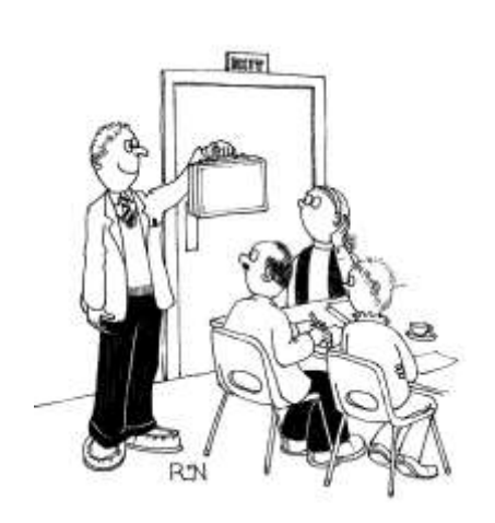
The treasurer made the most of his moment in the limelight

Ban sliced cheese. Make Britain grate again.