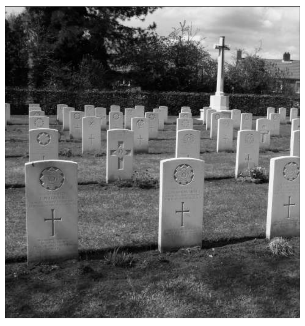
Abbots Morton, Rous Lench, Church Lench & Harvington www.archbenefice.org.uk